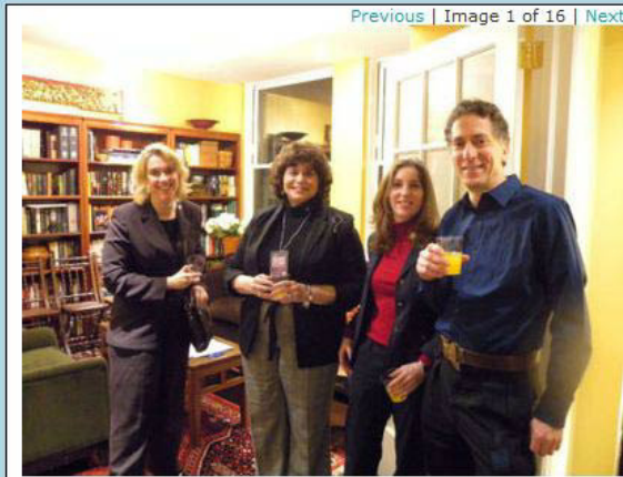
Before the stories began.